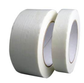
704 Utility Filament

Palletech Berry Plastics high performance, hand applied stretch film. Available in three convenient sizes for immediate shipment with your Nashua HVAC tape order. Contact your sales representative for details.